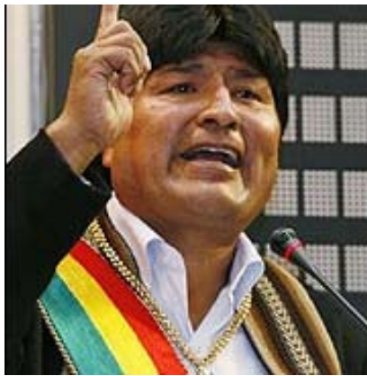
Bolivia's New Leader Vows Change

http://news.bbc.co.uk/1/hi/world/americas/4087510.stm