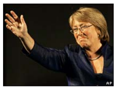
Bachelet called on Chileans to work together to solve their problems