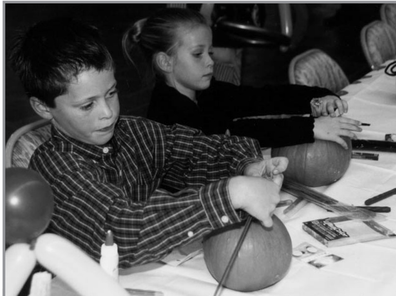
Future Oregon lawyers at Night at the Knight 2002