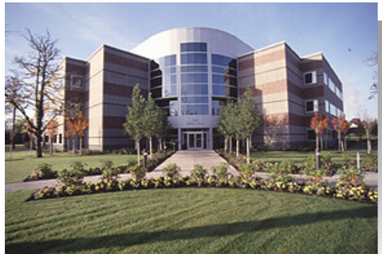
RIVERFRONT RESEARCH PARK

. The Riverfront Research Park includes this 60,000-square-foot building and the nearby Innovation Center, which provides low-cost for emerging high-tech companies. Current tenants do business in the areas of artificial intelligence, biotechnology, neuroscience, educational and entertainment software, and software engineering. Located on a 67-acre parcel along the Willamette River, the park is only a short walk from the University of Oregon and from downtown Eugene.