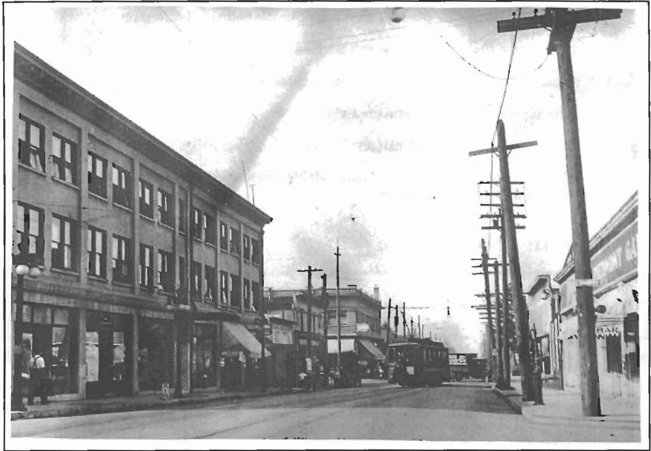
Trolley Car at Killingsworth and Albina in the 1920's.