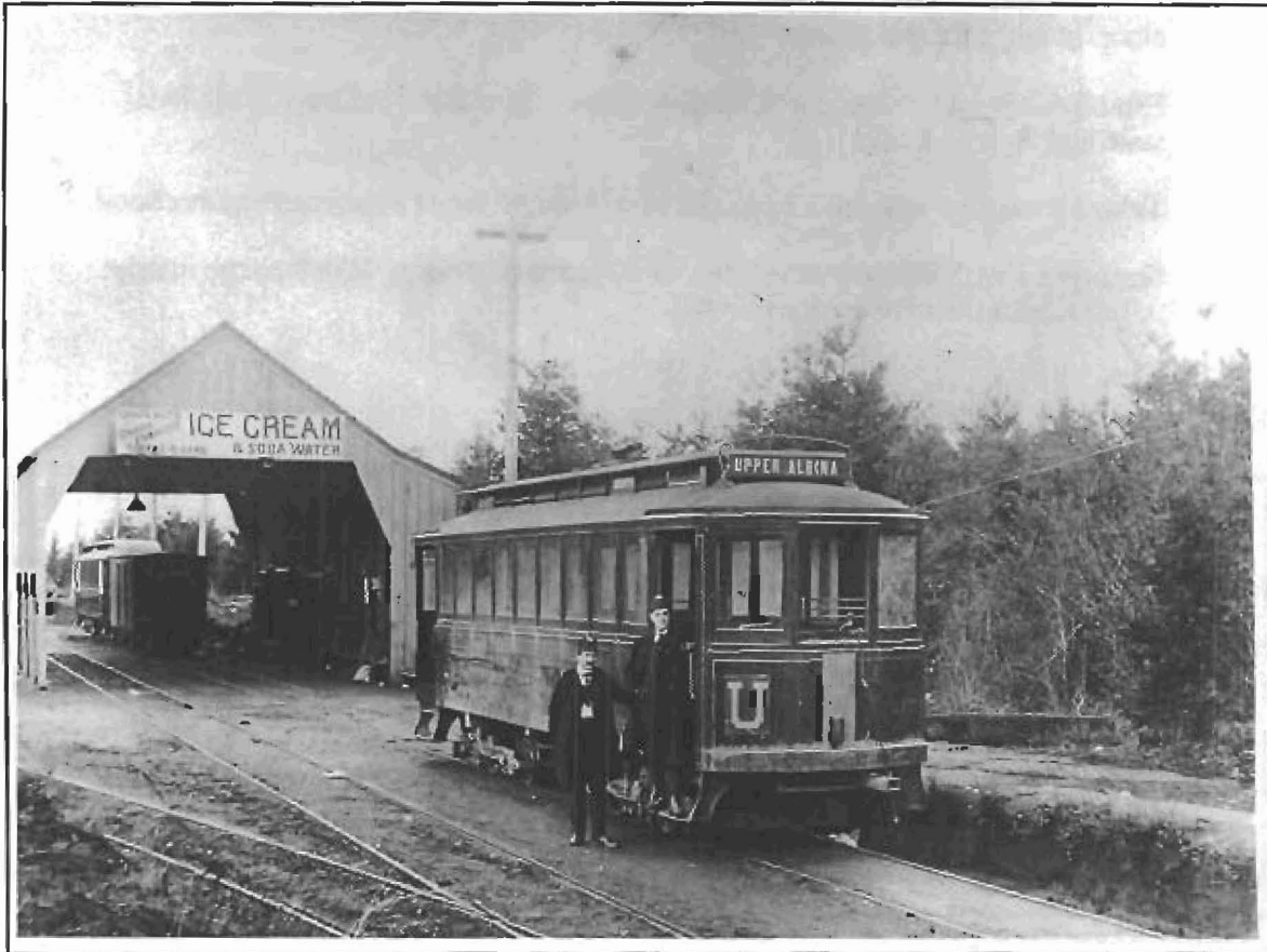
Humboldt and Albina were well served by a trolley system in the early part of the century. (OHS)