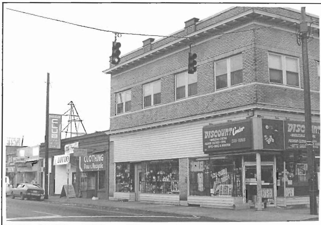
New retail businesses and restaurants are springing up along Killingsworth Avenue.