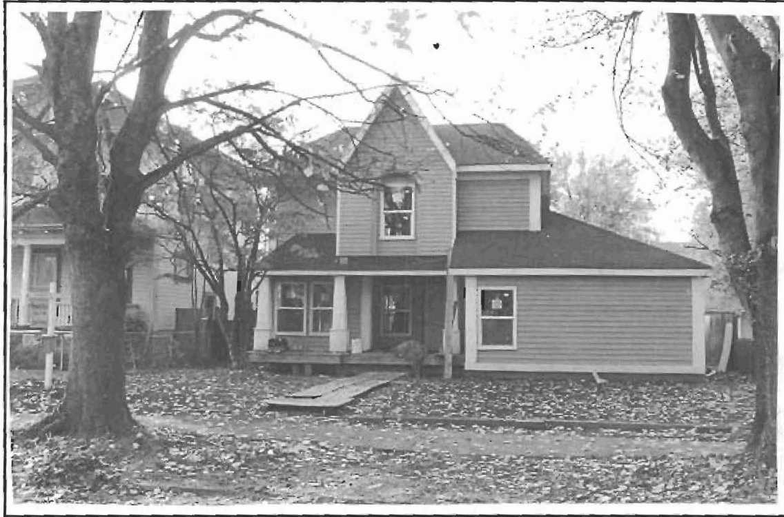
This House uses modular construction to achieve compatible and affordable housing in the Piedmont Historic Design Zone.