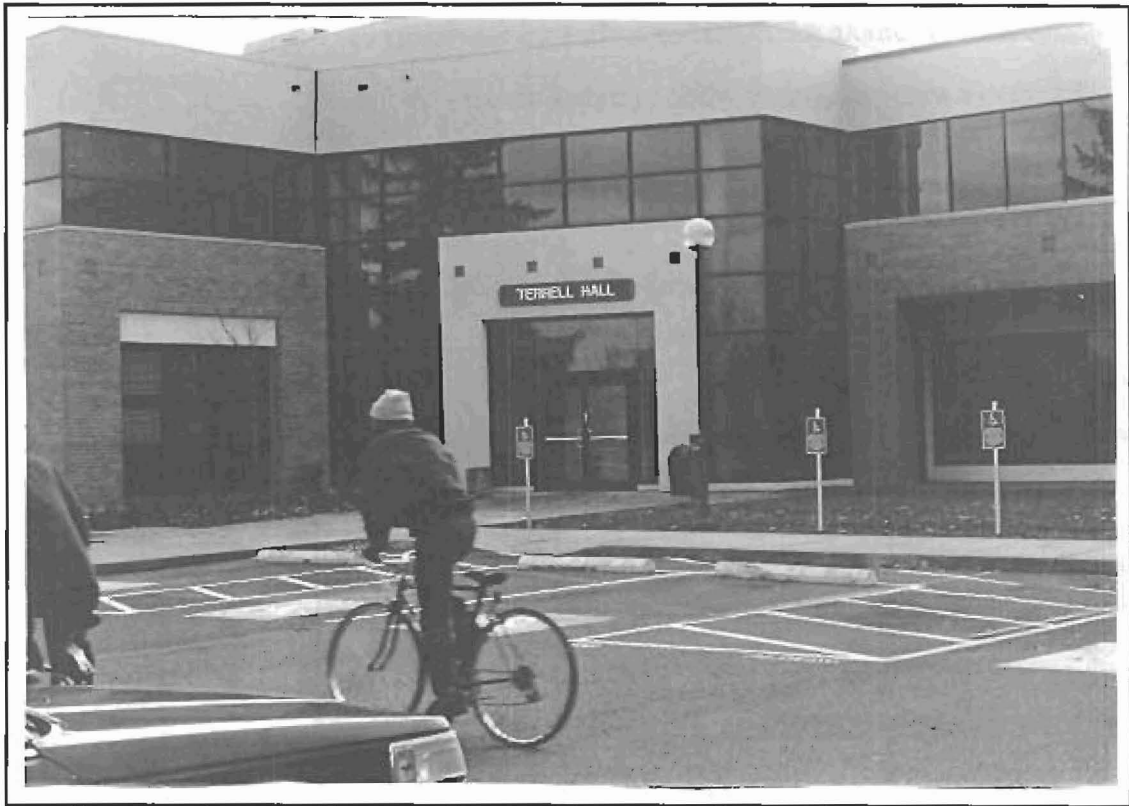
The Portland Community College Campus is an important center for activities in Humboldt and along with Jefferson High School is part of an area zoned Institutional Residential.