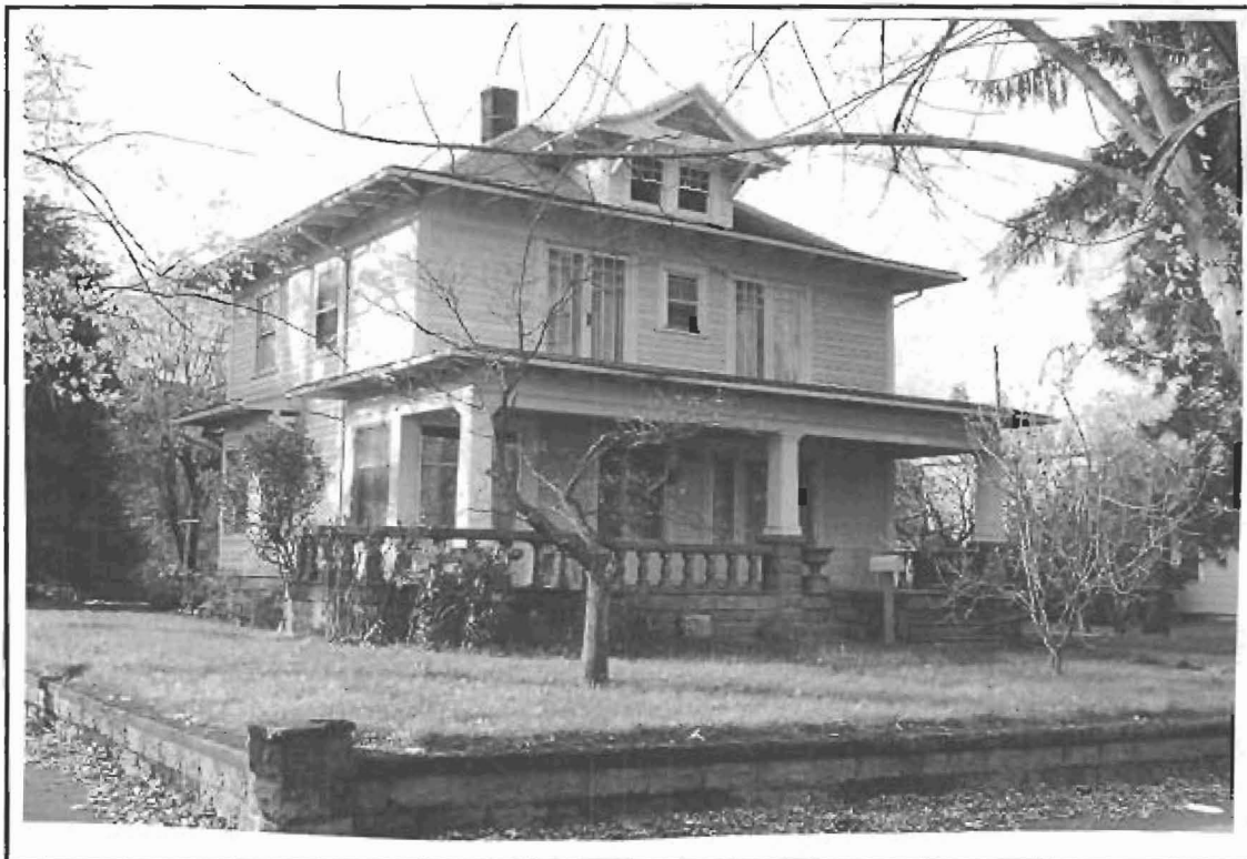
Part of the Piedmont Historic Design Zone is within the boundaries of the Humboldt neighborhood.