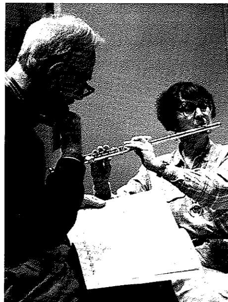
Composer-in-residence George Rochberg rehearses with Ensemble Viento of Portland State University.

Music Today was an ideal venue for two academic conferences that were held concurrently with the festival: the Northwest College Music Society, and the inaugural meeting of the West Coast Conference of Music Theory and Analysis. Music scholars and theorists from around the country and several foreign