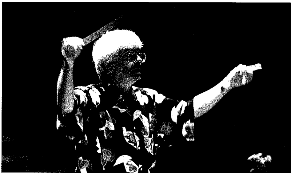
Conductor and Artistic Director Helmuth Rilling.