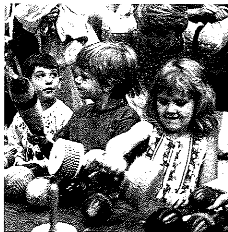
Children explore instruments during one of the International EarPort concerts.

On the chamber concert scene, festival crowds flocked to Beall Hall for two