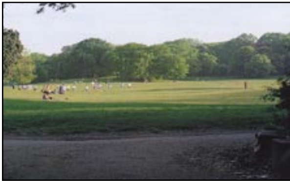
The long meadow in Prospect Park, Brooklyn, with its expanse of lawn edged with large trees.

One of the most striking features of the Children's Arboretum site are the long vistas across a meadow framed by large canopy trees. It's a view not unlike those seen in the Long Meadow in Prospect Park in Brooklyn, New York. These views in the Children's Arboretum are notable because these are not commonly found in the city's parks and is clearly one of the site's most treasured features.