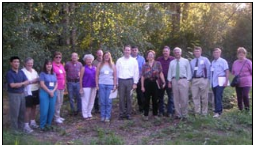
The PAC, Portland Parks staff, and visitors meet at the site for a field trip in the fall.

In addition to the PAC meetings, city staff also briefed the Urban Forestry Commission (October), the Bridgeton Neighborhood Assn. (November), and the Columbia Slough Watershed Council (November).