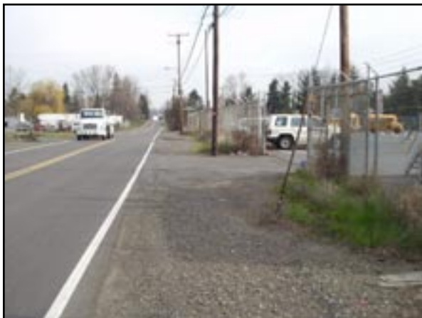
NE 6th Drive, looking north. The bus parking lot is at right.

One of the critical traffic issues focuses on access into the site and how park uses will affect traffic volumes and safety on NE 6th Ave. The intersection of NE 6th and Marine Dr. is particularly problematic, according to area residents, who believe that park improvements that generate significant increases in volume should be tied to a redesign of that intersection.