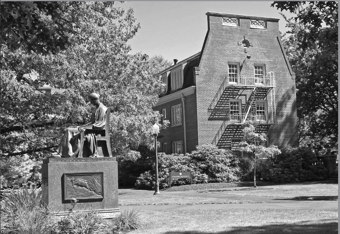
HENDRICKS HALL—HOME OF THE CENTER FOR THE STUDY OF WOMEN IN SOCIETY

PLANTING THE SEEDS OF EXCELLENCE: CSWS TOPS $2 MILLION IN GRANT AWARDS