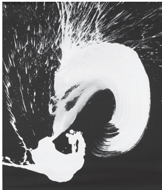
Kazuaki Tanahashi, Miracles of Each Moment , white on black, original one-stroke circle; acrylic on canvas, scroll (30" x 36") 2001.

Schneider is the founder and editor of the interdisciplinary journal, Climatic Change . He is editor-in-chief of the Encyclopedia of Climate and Weather and author of The Genesis Strategy: Climate