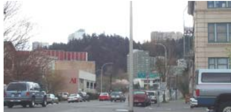
View from Downtown

The programmatic demands of a large institutional or medical building typically necessitate boxier building forms that often explicitly express the internal horizontal nature of the building on its exterior. Emphasizing a building's verticality, creating multiple building masses, and articulating visible facades are examples of design techniques that can support a building's internal functions while decreasing the visual prominence of large institutional development.