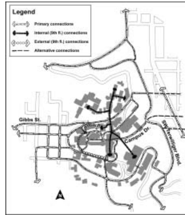
This diagram highlights the relationship of the campus's internal pedestrian system to external systems. Emphasizing stronger pedestrian connections to the Village Center at the west and the Terwilliger Parkway area along the eastern edge will link the hill's "9 th Floor" movement system to the adjacent, external context.

2. Developing new, and enhancing the existing, pedestrian connections from the campus's internal network to external systems.