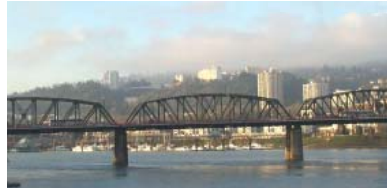
View from the Waterfront

developing more diversity in building sizes and orientations.