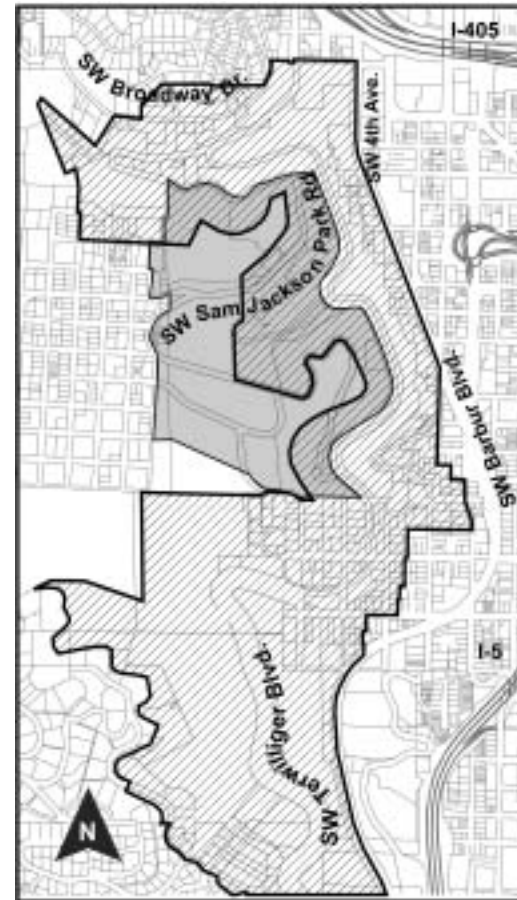
The Marquam Hill Design District is indicated by the shaded area, and a portion of the Terwilliger Parkway Design District is indicated by the hatched area