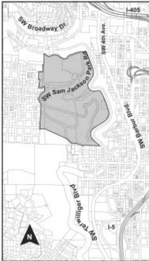
The Marquam Hill Design District is indicated by the shaded area