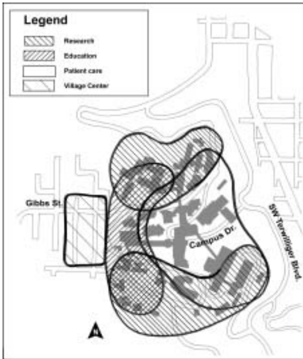
This diagram illustrates an arrangement of the hill's functional areas that locates the more intense functions in the core. This move allows the less-intense functions to spread out along the western boundary, encouraging interactions between students and residents of the Village Center. This arrangement of activities would be supported by the pedestrian and vehicular site development concepts discussed on the following pages.

1. Arranging the campus's activities to support each other and the adjacent context.