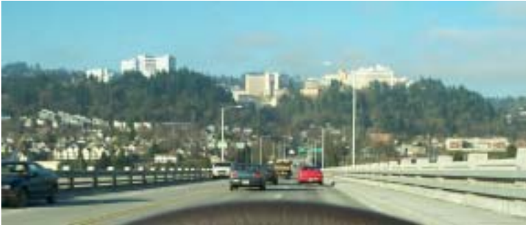
View from the Ross Island Bridge

The emphasis of this guideline is directed at the façades of buildings that are visually-prominent from distant locations in the city, as well as Terwilliger Parkway. The façades of new buildings that are not visually-prominent, (they either face the adjacent neighborhood or are oriented into the campus), do not need to address this guideline. For example, the inward-facing, campus-oriented building façades of a visually prominent development could exhibit more of a formal, wall-with-window-openings type of treatment, while its visible, outward-facing façades would be subject to the issues described here.