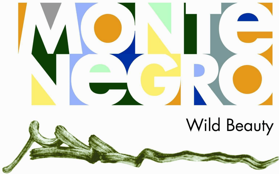
Figure 3. Current Montenegro tourism brand.