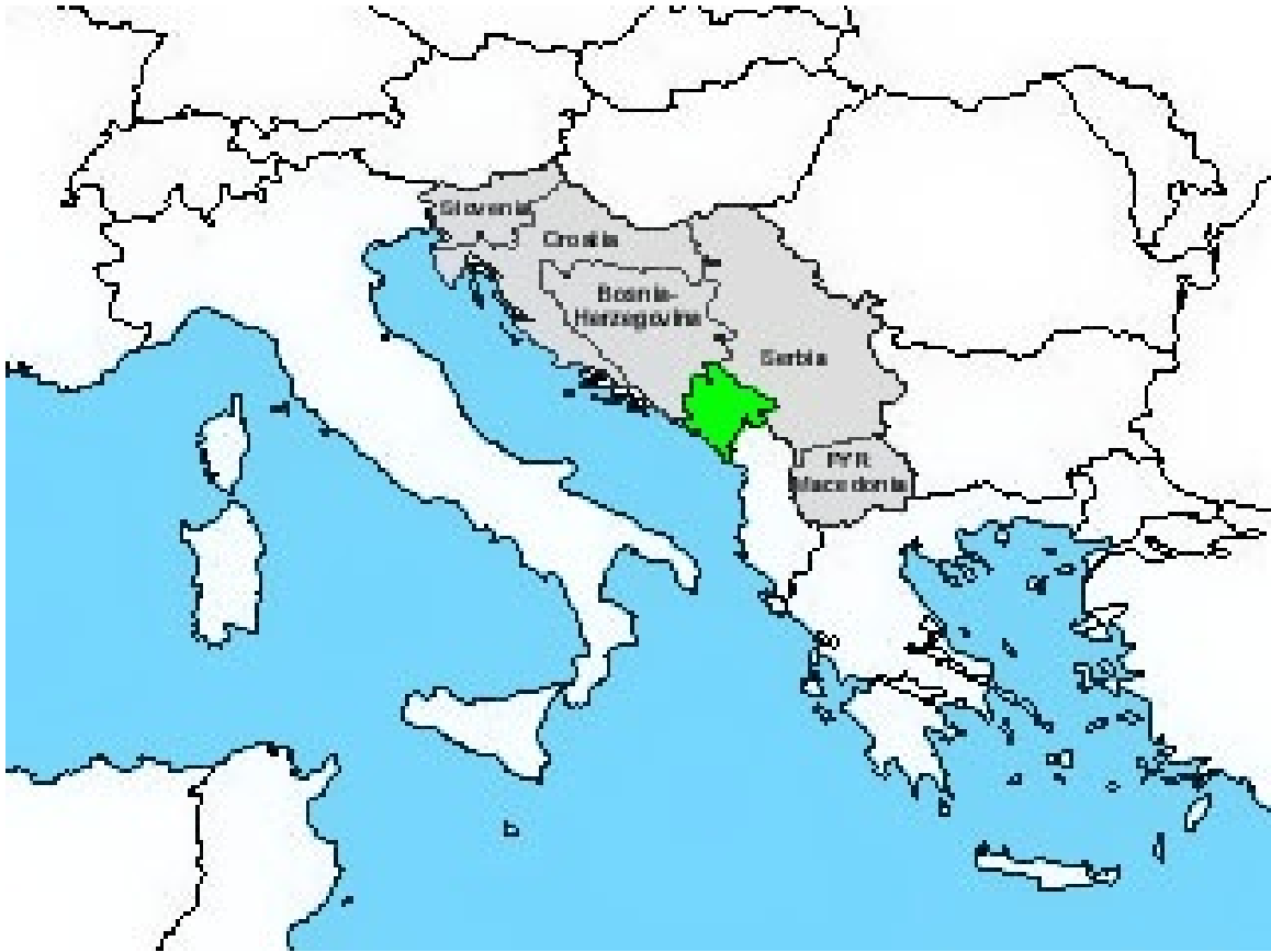
Figure 1. Montenegro and the Balkans.