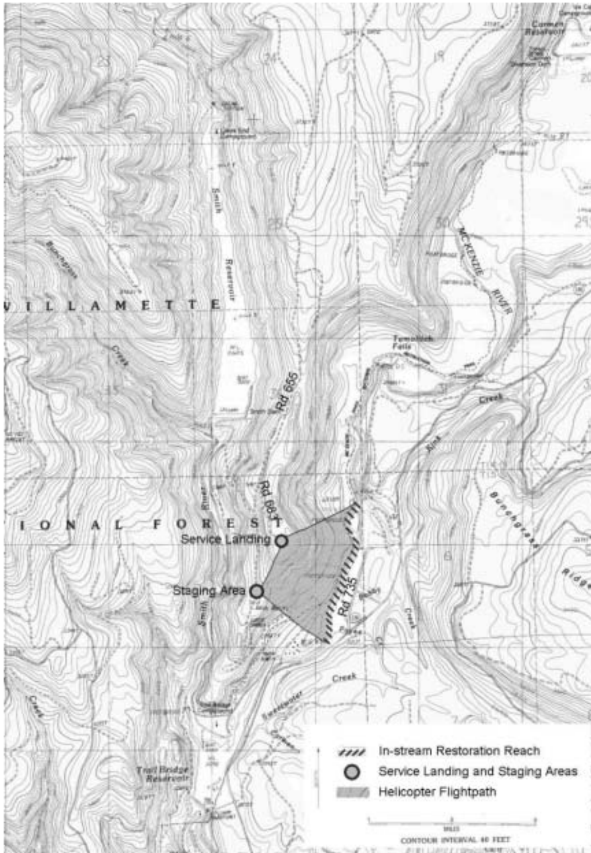
Figure 1. Project Area