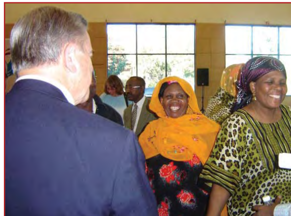
Mayor Potter meets with immigrants and refugees at a visionPDX Town Hall event organized by IRCO

Stereotypes. The disability community often experiences stigma and stereotypes that result in stress and a sense of being overwhelmed, leading to challenges in voicing issues and participating as successfully as desired. People who hold stereotypes of the disability community may not value the community's voices when working together to engage them ( Disability Engagement Forum ). The Hispanic Metropolitan Chamber shared that the main barrier to their community's participation is the public's negative perception of Latinos. Girls, Inc. stated that many girls encounter barriers to participation because their families might be more patriarchal culturally. Girls are asked to provide child care or care for family members over participating in civic activities.