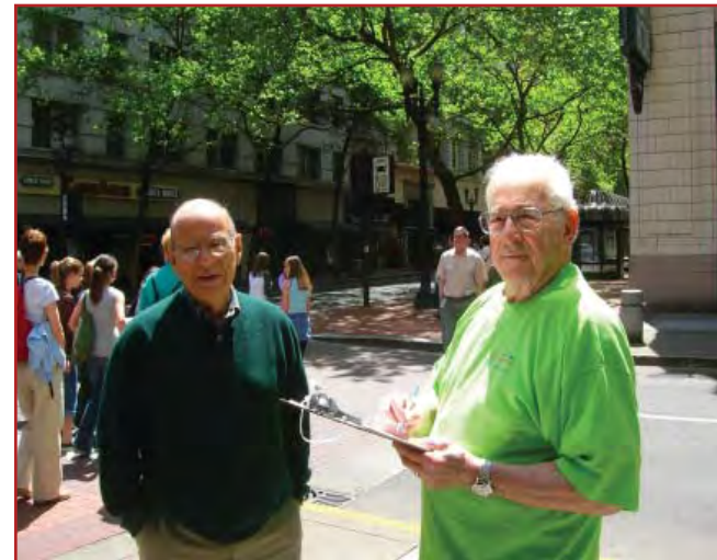
An Elders in Action volunteer hits the streets to survey community members.

Finally, the Community Engagement Report offers hope and reasons to continue to be inspired while involving community members in discussion and thoughtful decision-making. Through stories from participants as well as through the authentic sharing of trials and successes in the field, the report aspires to bring readers closer to connecting with one another, our neighborhoods and our government.