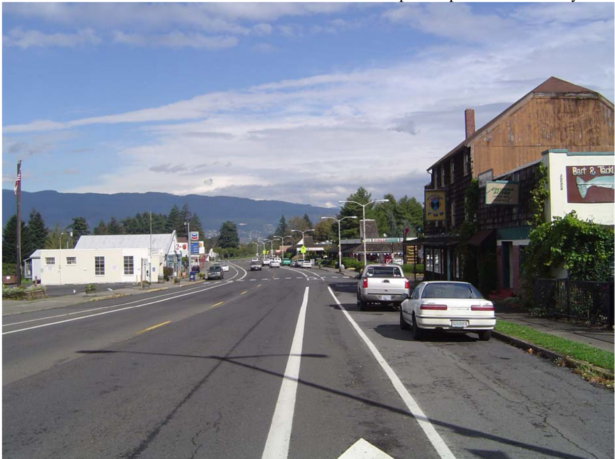
Downtown Cascade Locks looking east.

From the 1950’s to the 1980’s, Cascade Lock’s economy was strong. Timber from the Mount Hood and Gifford Pinchot National Forests was an important part of the economy.