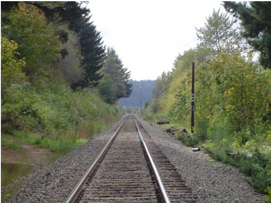
Railroad near Dry Creek looking west.

Investigate the potential for providing an access route for firefighting vehicles where it does not presently exist.