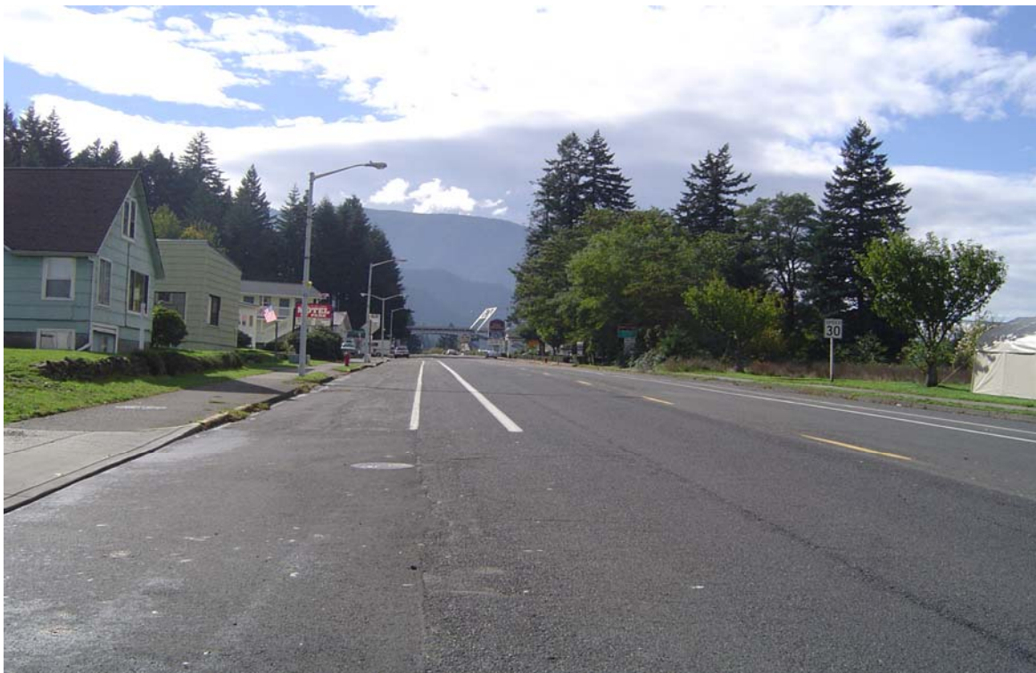
Downtown Cascade Locks looking west.

Today, the economy of Cascade Locks is slowly shifting to that of a tourism base. The community has dining, lodging, camping, an airport, marina & boat launch, automotive