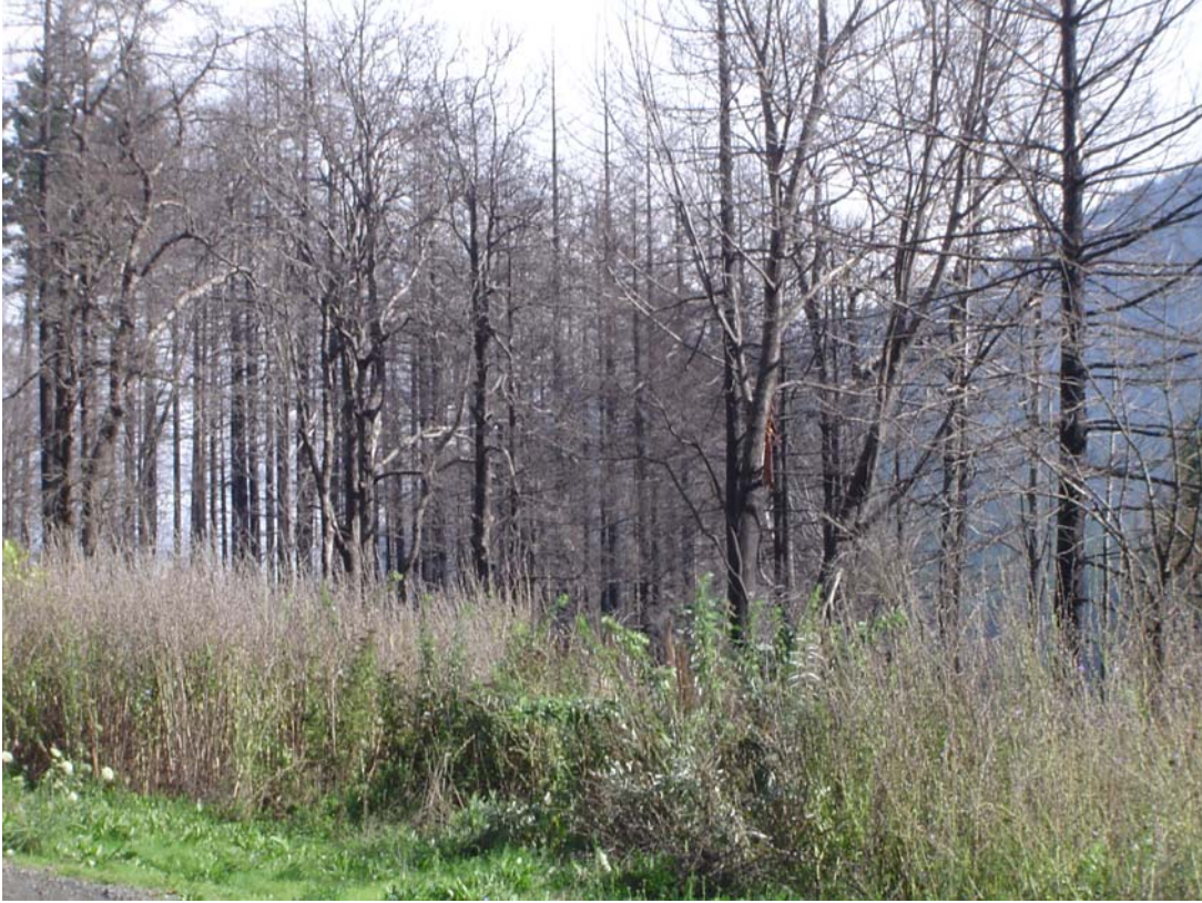
Fire-killed trees (2003 wildfire) within the city limits.

The Union Pacific Railroad runs the entire length of the city and makes up its northern boundary for most of the way. The railroad right of way (ROW) is rated as a high wildfire hazard area for its entire length, with the exception of about one-half mile along the marina. The railroad ROW has heavy brush and/or trees for most of its length within the planning area. In some areas, branches from adjacent trees actually hang over the rails. Also, there are piles of old railroad ties left along the ROW in places. On some portions of the rail line there is no access road for firefighting vehicles. The railroad does some vegetative management to reduce wildfire hazards, but serious wildfire hazards continue to exist.