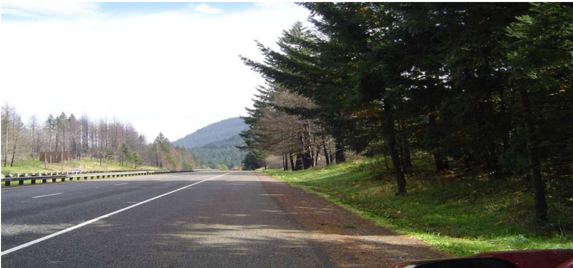
I-84 looking east.

vehicle could easily start a fire in the grass and brush along the highway ROW which could spread into nearby areas with heavy fuel conditions. There is only a short distance between the driving surface and adjacent vegetation. One positive factor is that drivers are not allowed to stop along the interstate, except for emergency purposes. This factor reduces the chance of drivers starting a fire while taking a break along the roadway. Another risk factor involves maintenance activities by ODOT. The agency annually mows grass along the ROW and this activity could start a fire if the mowing blade were to strike a rock or metal object. ODOT does require a vehicle with water to follow the mowing operation during high fire danger periods.