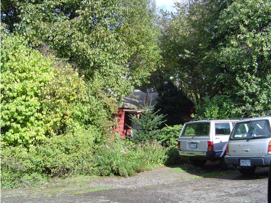
High wildfire hazard home in Cascade Locks.