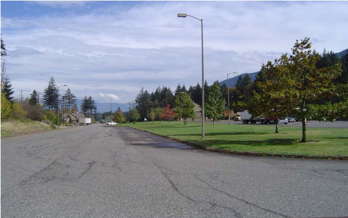
Oregon Department of Transportation Weight-Master Station.

The Weighmaster Station along I-84 may offer the best option for a safety zone in Cascade Locks. Other options are the Cascade Locks School and the Port's Marina Headquarters. However, the school is in close proximity to heavy fuels to the east and access to the marina is limited.