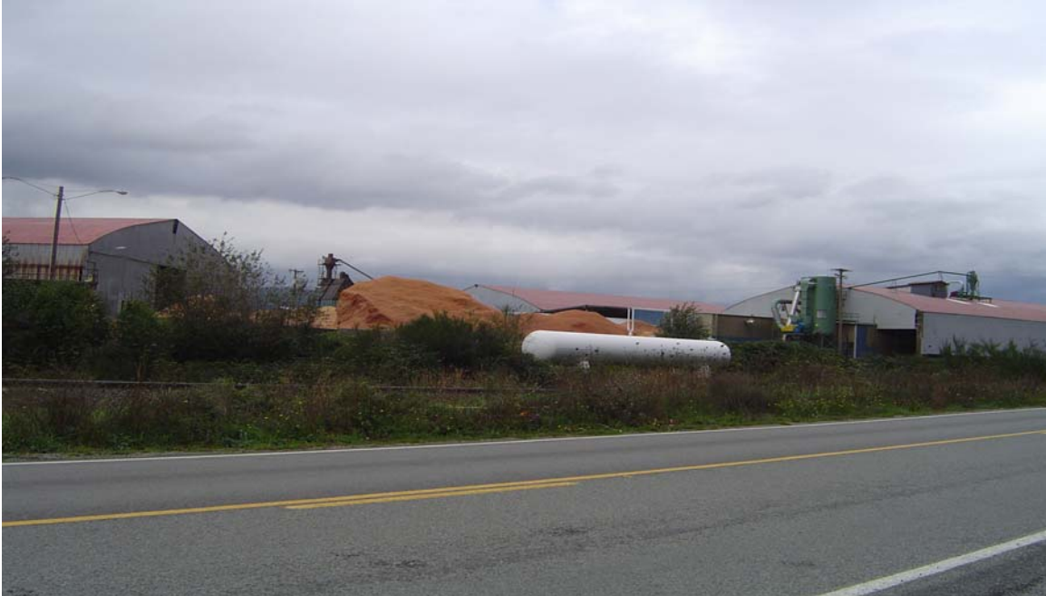
Propane tank next to railroad and sawdust piles.

In summary, the downtown and residential area of Cascade Locks is nearly surrounded by areas considered to have a high wildfire hazard rating. This high rating is the result of heavy fuel loads and in some cases, steep slopes. These conditions have created a hazardous situation for residents of Cascade Locks and their property.