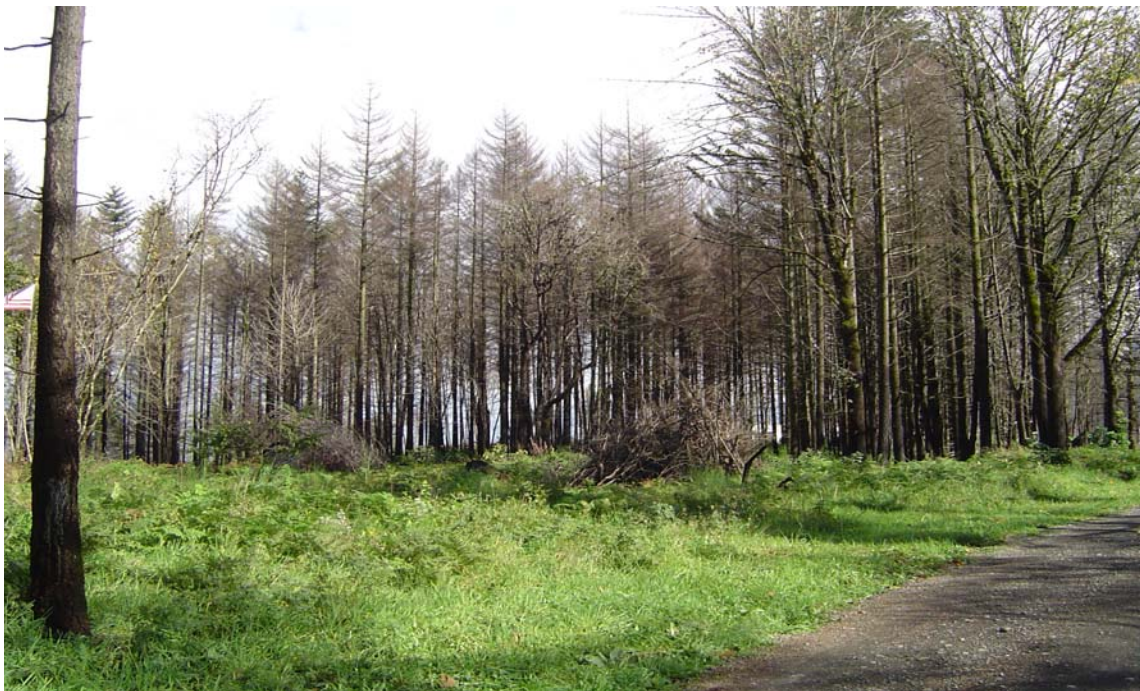
Example of fire-killed trees (2003 wildfire) being disposed of in Cascade Locks.

The September 2003 wildfire in Cascade Locks left large areas of fire-killed trees and brush. The wildfire may have initially reduced the overall fuel load in much of the burned area. However, as the fire-killed trees deteriorate and begin to fall down, surface fuel loads will increase and may present an even worse wildfire hazard. Fire-killed vegetation is easier to ignite and can burn with more extreme fire behavior as compared with live vegetation including some, or all, of the following: long flame lengths, high rate of spread, prolific crowning and/or spotting, presence of fire whirls, strong convection column. These conditions make wildfire suppression difficult and hazardous for fire fighters. Some of the fire-killed vegetation has been removed, but much remains to be treated. Portions of the remaining dead wood may be utilized as fire wood by city residents and this may be an incentive for getting it removed.