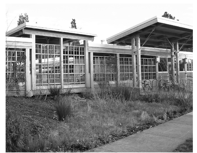
Moss Street Children's Center bioswale

The Campus Plan's "Policy 12: Sustainable Development" Policy states: