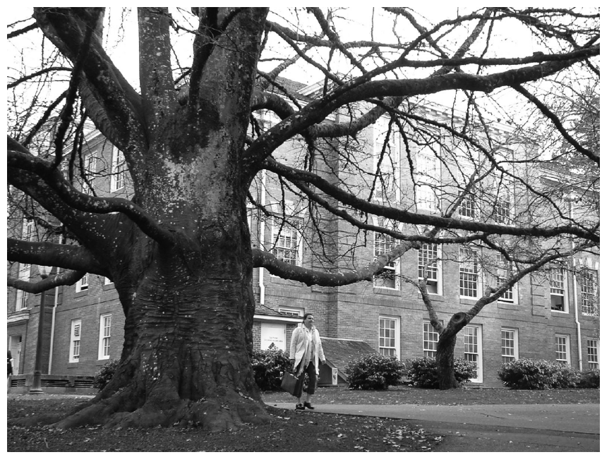
Large canopy trees, such as this beech, have important environmental and design roles on campus.