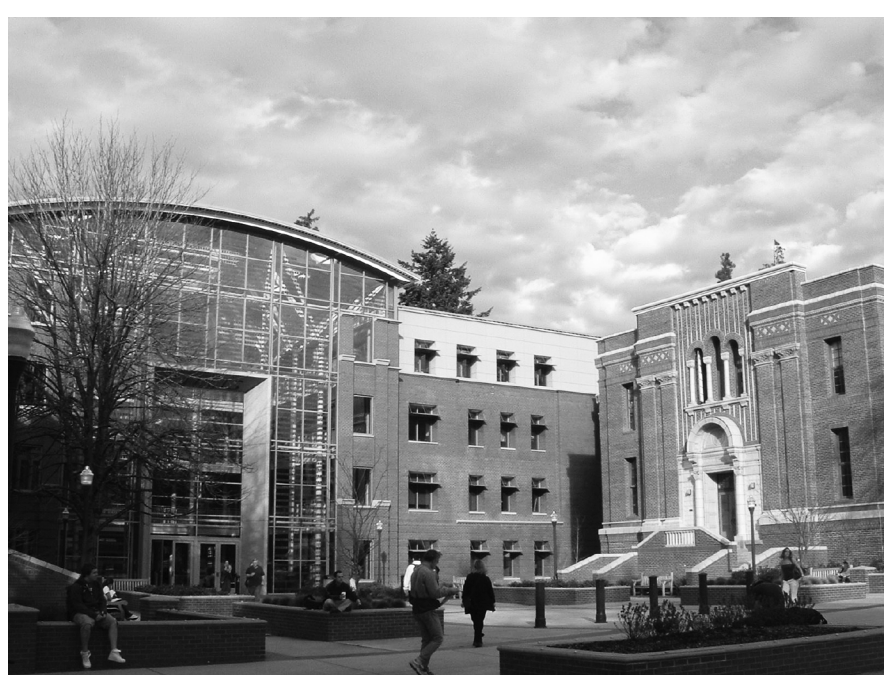
Lillis Business Complex was the first LEED-certified building on campus. It contains a comprehensive mix of sustainable design features.

On-campus bus stations and free bus passes make transit easy to use.