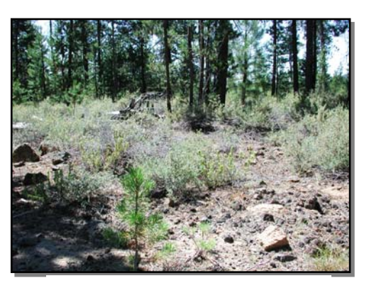
Castilleja chlorotica habitat