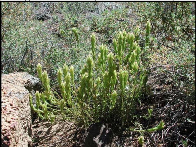
SpeciesProbabilityCastilleja chlorotica (Green-tinged paintbrush)LowSee Appendix B for a description of habitat for this species.