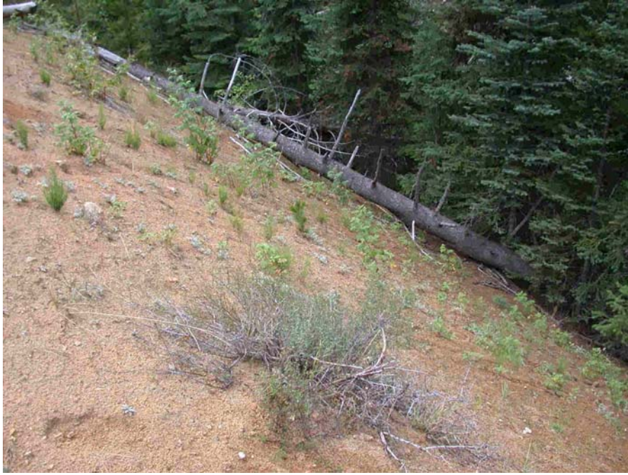
Photo 1. Wasterock pile adjacent to Granite Creek.