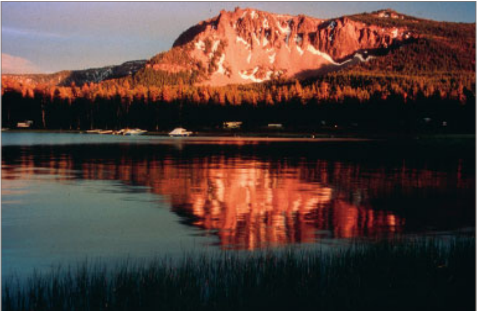
Paulina Lake is a popular recreation spot in the summer.

Recreation fees funded approximately 85% of the Lava Lands Visitor Center and Lava River Cave operations as well as many educational programs across the Forest. More than fifty miles of trails were maintained and fences and picnic tables were repaired. Funds were also used to support youth programs such as Youth Conservation Corps and Americorps.