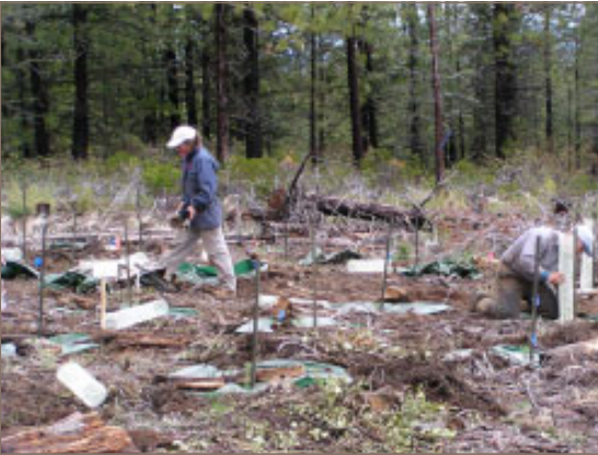
Young trees are planted in the Sugar Pine stock study area.

The Deschutes National Forest produced more than 65 million board feet of timber, issued 5,559 Christmas tree permits and sold 7,652 cords of firewood - all of which contributed wood products and jobs locally and in other areas of the Pacific Northwest.