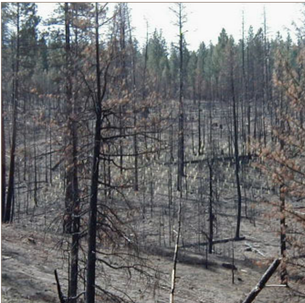
Rows of young trees help with reforestation in fire areas.

As soon as communities in Central Oregon had their Community Wildland Protection Plan (CWPP) in place, the Federal agencies began taking suggestions from homeowners to implement streamlined HFRA projects. The first was the East Tumbull Project west of Bend. Other fuels reduction projects that are in planning stages are Sisters Area Fuels Reduction Project (SAFR) near the community of Sisters, as well as projects in South Bend and Sunriver.