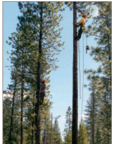
Pruners remove mistletoe from trees so it doesn't spread. Mistletoe stunts tree growth thus slowing their development to become large, old growth trees.