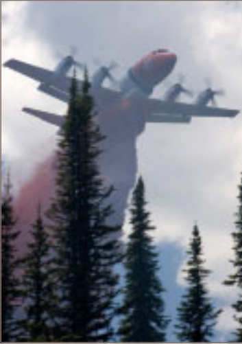
Dropping retardant on fires cools hot spots, and slows fire activity, allowing firefighters on the ground to gain control and put the fire out. In 2006, more than 1.148 million gallons of retardant were delivered—the highest amount in 10 years.