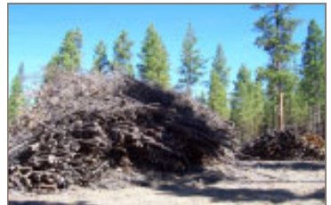
Benefits of using biomass include: wood is plentiful, carbon neutral and costs much less than fossil fuels; supports the local economy, and creates a market for hazard fuel reduction.