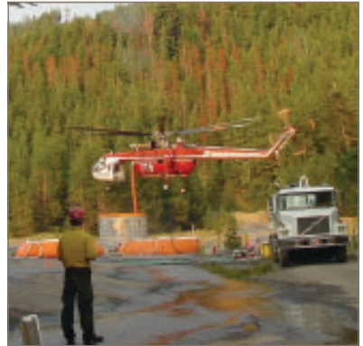
The Redmond Cache provides support for firefighting activities such as this helitanker. The Cache moved $28 million of the total $47 million regional cache inventory, exceeding the 10 year average.

After the Fire... Post-fire recovery is thematic to land stewardship in the Deschutes National Forest. Working with our communities in Central Oregon, we learn and adapt to changed forest conditions in fire-affected landscapes. Short-term recovery efforts focus on stabilizing soil, protecting water quality and other resources, and ensuring public safety in and around wildfire areas. When the fire is out and all the firefighters have gone home, rehabilitation efforts begin to help the area recover from catastrophic wildfire. Over 7000 acres were planted with trees in the 2003 Davis and B&B fire areas. Ninety five percent of the planned timber salvage was completed for the B&B fire area on the Sisters Ranger District. A 250 acre salvage project will occur on the 2006 Black Crater fire area also on Sisters Ranger District