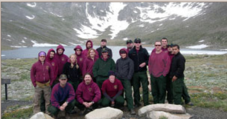
The Mobilization Center was activated for 82 days, the longest in our history. During this time 111, 20-person crews; 181 pieces of equipment; and 95 members of Incident Management Teams were accommodated. Pictured here is the Interagency Hotshot Crew.

District and Forest staff worked closely with Oregon Department of Forestry, counties, and citizen groups preparing Community Wildfire Protection Plans (CWPP). With the exception of Elk Lake, CWPPs are completed for the entire wildland urban interface with the Deschutes National Forest. Both project planning and/or fuels treatment implementation are underway in the Sisters, Crescent, Greater La Pine, Upper Deschutes River, Sunriver, and Bend CWPP areas.