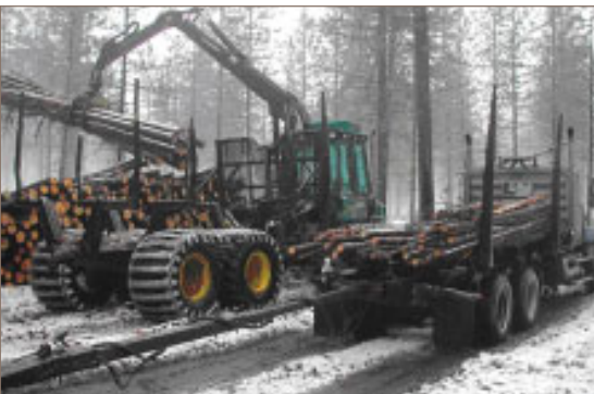
Active forest management utilizes many tools to restore forest health. Timber production is a by product of forest restoration harvests.