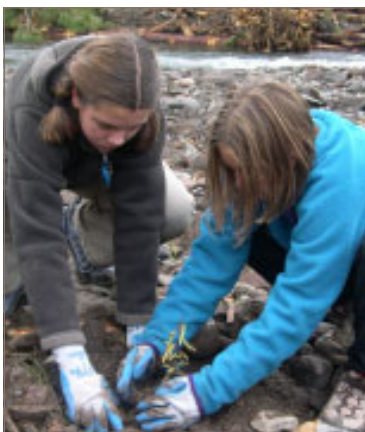
Students help plant seventy thousand seedlings to restore natural vegetation and improve riparian stability.

This outstanding project was accomplished in cooperation with the Upper Deschutes Watershed Council, National Forest Foundation, Oregon Watershed Enhancement Board, the City of Bend, the Deschutes River Mitigation and Enhancement Program, and students at Summit High School. Thank you, Partners!