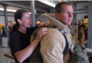
"Buddy checks" help ensure Smokejumper safety. This summer they successfully completed 419 jumps on 90 fires.