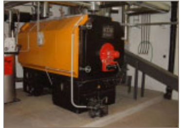
High efficiency boilers such as this one have very clean emissions and are in mass production and used in thousands of buildings in Europe.

In January of 2006, the Forest Service, Pacific Northwest Region and BLM in the State of Oregon signed a memorandum of understanding (MOU) with the Confederated Tribes of Warm Springs (CTWS) to offer residual woody biomass from approximately 8,000 acres per year of thinned forests within the geographic scope of the MOU. This converts to approximately 80,000 “bone dry tons” of biomass per year. A proposed biomass energy generation plant located at the Warm Springs mill site would remove and utilize the woody biomass material from forest projects (and other wood waste sources) to generate up to 15.5 megawatts of renewable energy available for sale. The CTWS estimates that is enough power generation to provide over 15,000 homes with renewable electricity.