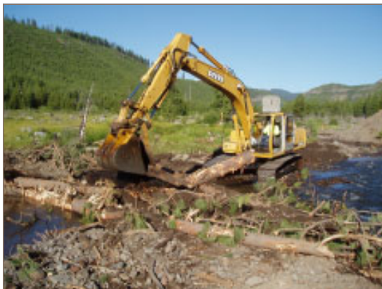
More than 2,100 trees were used to create log jams and pool habitat which in turn improved wildlife and fish habitat