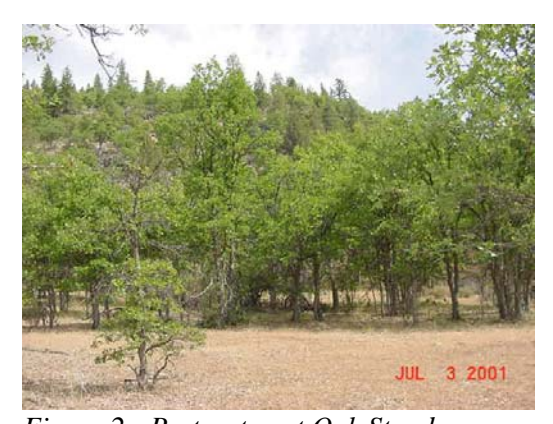
Figure 2: Pretreatment Oak Stand

The proposed oak thinning would occur on approximately 200 acres (see Map 2). The stands proposed for treatment are very dense stands of Oregon white oak with a lesser component of California black oak (Photo 2). These stands would be thinned using chainsaws. The cut material would be lopped and then piled in preparation to be burned at a later date. The remaining oaks would be spaced at a variable width of 15-20 feet between leave trees (Photo 3). The majority of the oaks range between one inch and eight inch diameters at breast height (DBH). Those trees greater than 12 inch DBH would be reserved from cutting. The piles would be partially covered and burned in the late fall or winter after the piles had cured. No commercial utilization is planned for the cut material due to its size and location within the river canyon but there may be some miscellaneous use for firewood due to the proximity of the Klamath River campground.