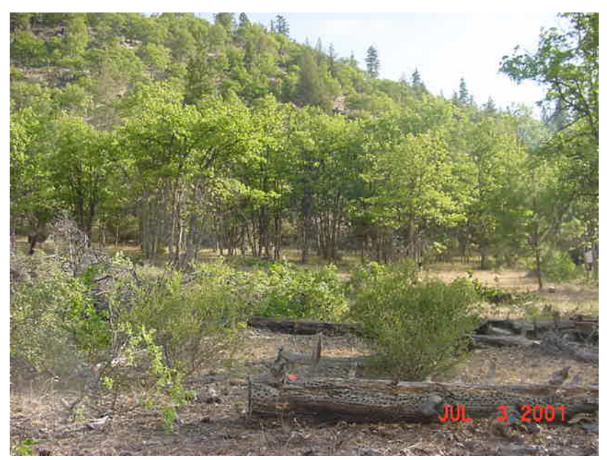
Figure 1: Typical Oregon White Oak Stand in the Klamath River Canyon. Trees are stunted and are in overcrowded growing conditions. Some California black oak is generally intermixed within these stands.

Since European settlement, several factors have allowed changes in the vegetative communities to occur. Native American subsistence burning has been eliminated, heavy grazing has occurred in certain areas and active fire suppression has occurred in the project area (USDI 2003). Historically, in the conifer forest/woodland communities the estimated fire return interval is 10 to 20 years. In the oak woodland communities the fire return frequency is estimated to be shorter at 5-15 years (USDI 2003). The change in fire frequency has resulted in an altered vegetative landscape. The oak stands in particular have transitioned into overstocked stands of stunted Oregon white oak and California black oak (see Photo A.). There have been very few larger fires in the canyon although here have been 20 documented lightning ignitions within the Klamath River Canyon from 1990 to 1999 (ODF as stated in USDI 2003). Portions of the proposed burn area, and portions of the canyon in general, are heavily infested with yellow star-thistle ( Centaurea solstitialis ), medusahead ( Taeniatherum caput-medusae ), and cheatgrass ( Bromus tectorum ).