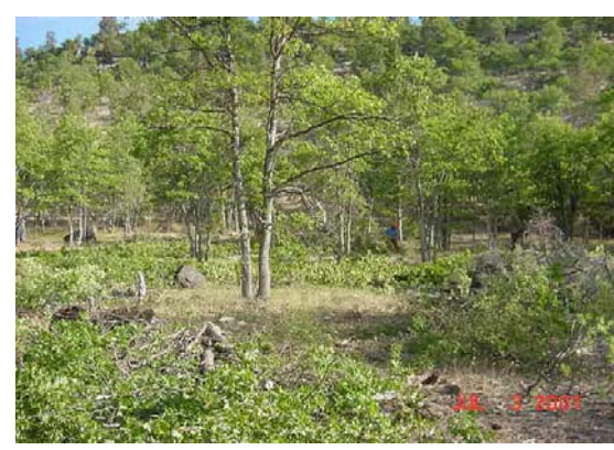
Figure 3: After Treatment Oak Stand

In order to achieve and maintain the results of more open growing oak woodland, subsequent treatments would be necessary. These proposed treatments would consist of applying prescribed fire to those units to eliminate the oak sprouts after the initial cutting and maintain open growing conditions for the remaining oak trees. Due to the position of the oak units within the canyon, the area of prescribed fire will be larger than those units (See Map 3). They would need to be expanded to be able to logistically apply prescribed fire and hold the fire within the defined boundaries. The approximate additional prescribed fire areas would be the area above the oak units to the top of the river canyon. Two of the proposed units are within the prescribed fire unit. The prescribed fire objectives would be consistent with those described in the Big Bend Prescribed Burn section above.