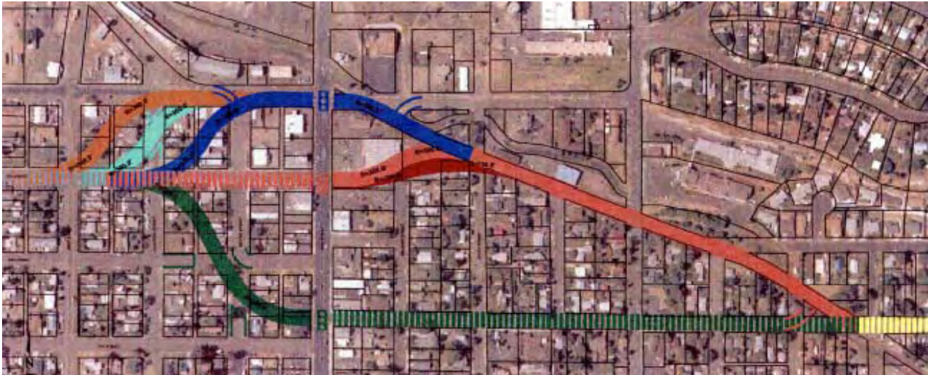
Source: W&H Pacific. Prineville Transportation System Plan, Northern Arterial Exhibit. Plot date 3/1/05.

10 th Street to Railroad (with brown alignment)