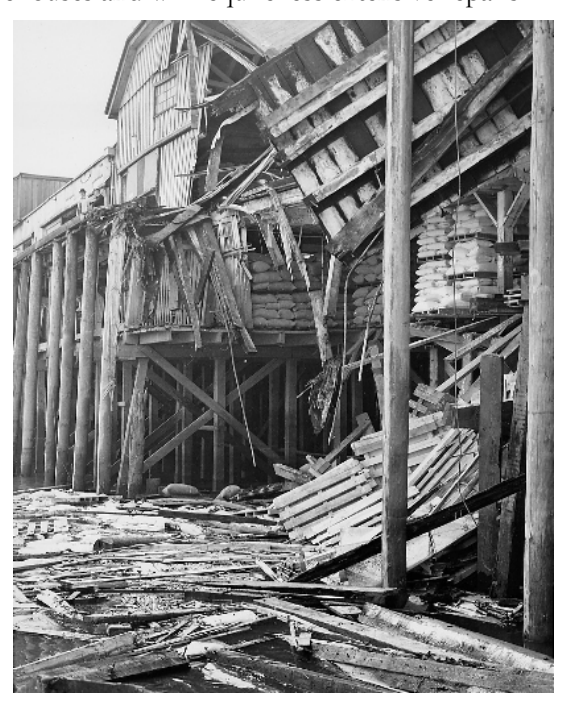
Collision damage from the Aegean Mariner, 1965

Warehouse D has two parts, both designed by leading Portland architect Morris H. Whitehouse. The building measures approximately 100' x 160' and is one-story structure with a basement. On the east side, the basement level becomes the lower level of a two-story dock. The structure consists of an elevated concrete deck for the eastern 100' of the basement; a heavy timber first floor supported on timber columns; and a wood roof with timber trusses. Repairs to the foundation were made in 1933 and 1939. The building has significance as a rare example of industrial design by Whitehouse. Warehouse D generally appears to be in fair condition above the basement level. However, decayed timber framing is evident in several locations, likely due to roof leaks. Below the lower dock level there is extensive decay in the timber pilings at the water line.