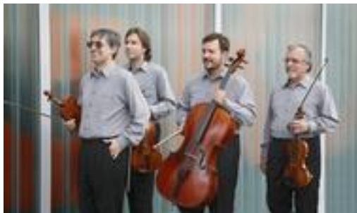
The Borodin String Quartet