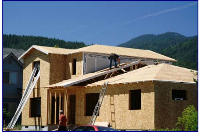
Pictured above are the two new common wall ACLT-Habitat homes units under construction Photo: June of 2006.

During September of 2005 ACLT expended $80,000 in CDBG funds to purchase a vacant parcel on Garfield Street to complete two new ownership units. ACLT worked in collaboration with Habitat for Humanity to develop these homes. With this partnership the units were created to benefit households earning 60%AMI instead of the original income target of 80%AMI. The ownership of the land by ACLT will secure that these units, built adjacent to their six unit apartment complex on Garfield St., will remain affordable in perpetuity. The two new units are nearing completion and are expected to be occupied in November of this year.