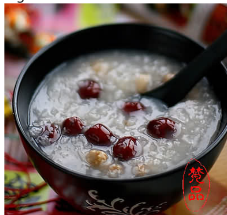
Laba Porridge

Laba is celebrated on the eighth day of the last lunar month, referring to the traditional start of celebrations for the Chinese New Year. “La” in Chinese means the 12th lunar month and ba means eight.