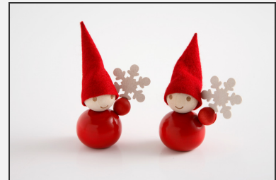
Lumihiutaaleet: Kaksi Aarikan lumitonntua

Suomessa on nyt talvi, ja toisin kuin täällä, talveen liittyy aina lumi ja jää. Ei voi sienestää, marjastaa tai metsästää, mutta ei ole myöskään tarpeen jäädä sisälle tai saunaan koko talveksi.