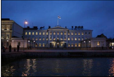
Suomen presidentinlinna Helsingissä

Tänä vuonna Suomi viettää 91:stä itsenäisyyspäiväänsä. Suomen itsenäisyyspäivä on 6. joulukuuta.